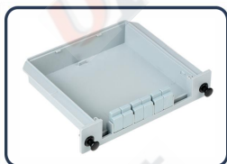
ABS plastic shell