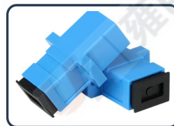
Low loss and good repeatability