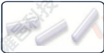
High quality ceramic ferrule