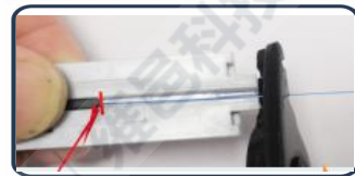
High fixed-length accuracy