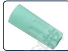
Threaded tail sleeve design, easy to install