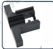
Butterfly clasp design