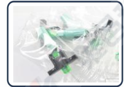
Packed in plastic bags for single use