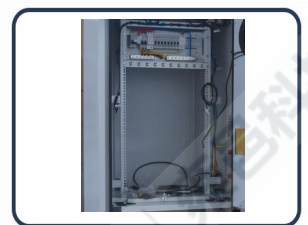
1 Configuration: 19 »; 2 Standard installation; 3 Flexible configuration.