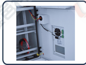
1 Heat Exchanger; 2 DC air conditioner.