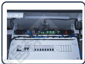
1 Monitor system.